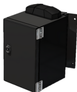
Vetted Covert Utility Enclosure - Black

High-performance PTZ camera system in a discreet, black utility box-style enclosure. Designed for unobtrusive deployment in urban and industrial environments, it blends seamlessly into surroundings for effective, low-profile monitoring.