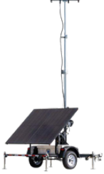
Vetted Mini Surveillance Trailer

The Vetted Mini Surveillance Trailer is a compact, portable solution for high-performance surveillance in tight or challenging environments. Rapidly deployable, it supports up to 4 cameras with solar-augmented power options for reliable short- or long-term operation. Ideal for construction sites, events, and general security use.