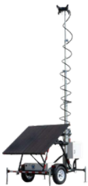
Vetted Standard Surveillance Trailer

Versatile mobile trailer combining license plate recognition (LPR) and a programmable message display for traffic enforcement, public messaging, and situational awareness, ideal for special events and limited-time deployments.