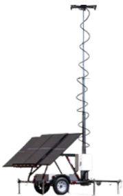
Vetted Long Run Surveillance Trailer

The Vetted Long Run Surveillance Trailer is engineered for high-demand deployments, featuring a powerful solar array and high-efficiency storage for continuous uptime in solar-rich environments. This system is built for sustained operation of multiple sensors and communications gear with no external power needed. Ideal for autonomous, long-term surveillance.